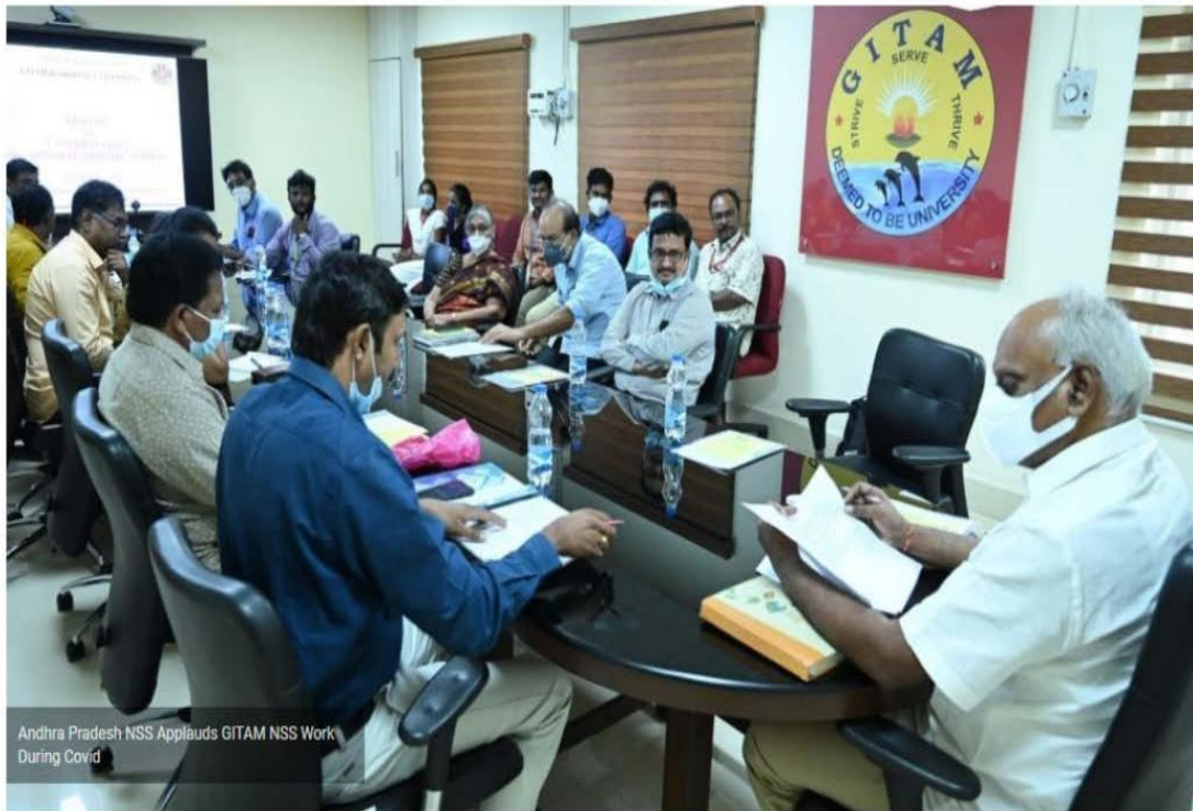
Andhra Pradesh NSS Applauds GITAM NSS Work During Covid

In a visit to the university, Andhra Pradesh State NSS officials applauded the efforts of GITAM NSS volunteers for rendering exceptional services during the challenging times of COVID-19