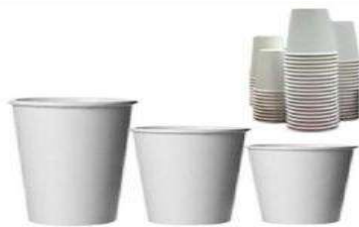
plasti coated plastic cups