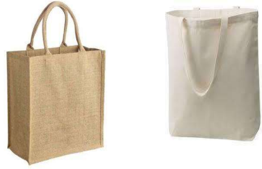
Cloth and jute bags