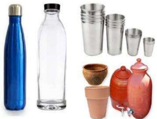
Glass bottles, metal containers, earthen pots