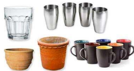
Glass tumbler, metal tumblers, ceramic cups, earthen pots