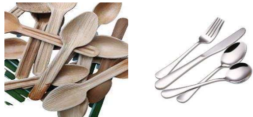
Areca nut cutlery and metal cutlery