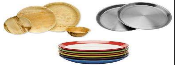
Areca nut plates, metal plates and ceramic plates