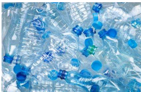
Plastic water pouches and plastic bottles