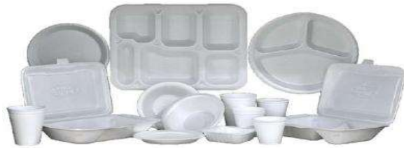
Plastic, foam plates or plastic-coated paper plates